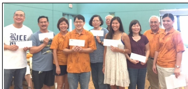
Recipients/representatives of fall semester Education Awards, Feb. 18, 2017.