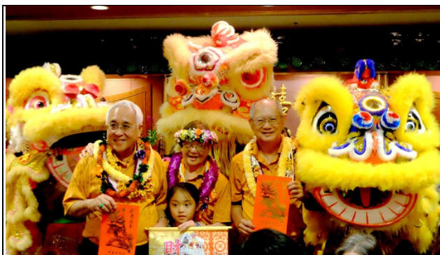
Three auspicious lions from Wah Ngai Lion Dance Club at opening ceremonies.

The burst of thunderous electronic firecrackers filled the banquet hall of Royal Garden heralded in the three prancing lions auspicious to the beating of drum, gong, and cymbals. The audience responded to the festive atmosphere by feeding them good-luck money.