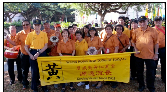
WKHT Marching Unit all ready to march down Hotel Street to River Street with gusto and enthusiasm.